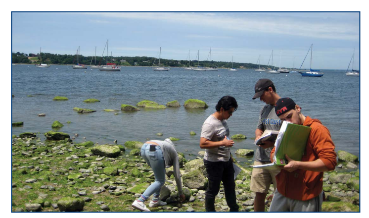
BIO 103 at Garvies Point

Each student in this class chooses a topic of ecological importance to apply concepts, research to compare past and present of the issue, prepare a PowerPoint presentation, and share with their fellow classmates during the designated colloquium session. The topics vary from Boston Harbor, Gray wolf in Yellowstone, deer unlimited, acid rain to wild fire. Students are provided with a self-assessment tool on this on-going activity. All sections of the project are included to make maximum of 10% of their final grade.