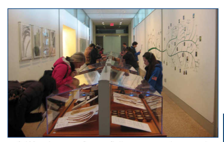
BIO 130 in the Britton Science Gallery at New York Botanical Garden, Bronx

Field trips in this course include Pfizer Lab at New York Botanical Garden or to Nature's Drug store to explore the substance that public uses instead of modern medicine to prepare a report based on the guided instructions. For example, use of red yeast rice (what is it? And does it work?) instead of statins for lowering cholesterol. When visiting New York Botanical Garden, students also visit the Britton Science Rotunda and Gallery to learn on-going ethnobotanical projects highlighted as "Ten Research Stories" about Plants and Fungi.