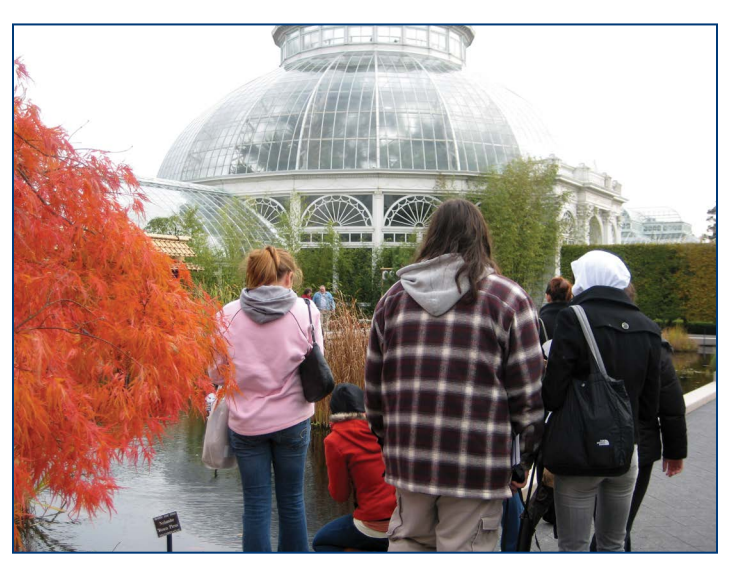
BIO 124 at New York Botanical Garden, Bronx

Students visit local botanical gardens (NY Botanical Gardens, Brooklyn Botanical Garden or Planting Fields Arboretum etc.) to visualize unique edible, medicinal, or plants of aesthetic value and compare those gardens with the natural preserves. Each student submits a video diary or comprehensive report on a garden based on the self-assessment tool.