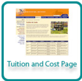
TUITION & COSTS