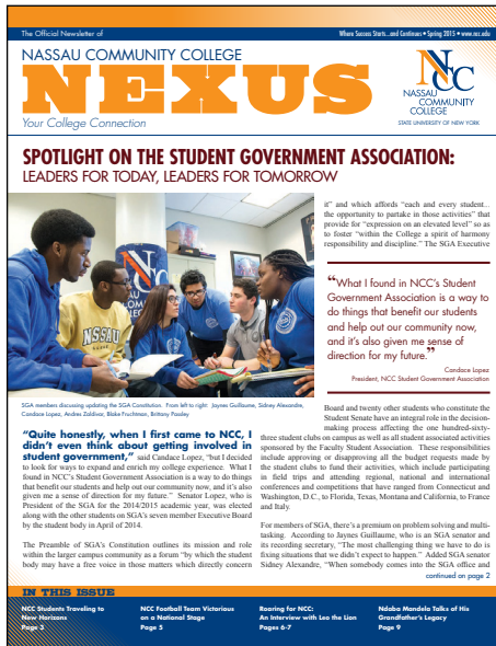
FRONT COVER: College Name First